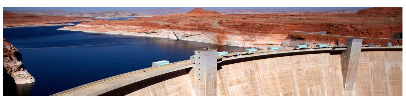
Glen Canyon Dam.

While the creation of the Lower Basin DCP reflects a commendable effort of collaboration, the process was anything but clean. In both California and Arizona, there was contentious infighting within state agencies that nearly derailed the whole plan. In Arizona, entities like the Central Arizona Project, the