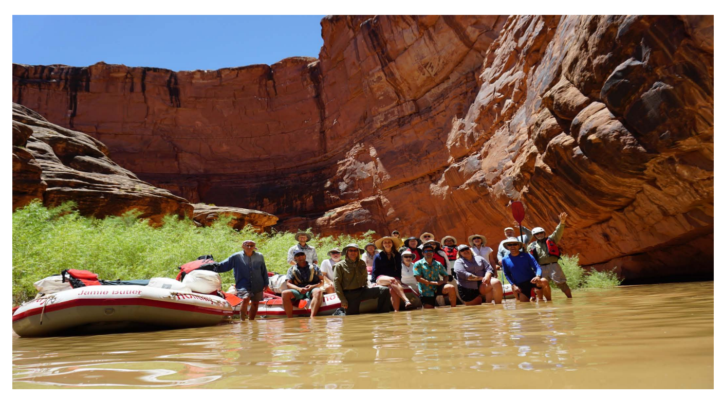
The GCI San Juan Crew basks in the shallow waters of Oljeto Wash.

With the first heat of the morning sun beginning to wake up the Southern Utah desert, a group of 15 adventurous GCI members gathered at the Mexican Hat boat ramp on the banks of the San Juan River to embark on four-day journey together. Often known for its sandy, warm water and tame summer flows, the river on this day was surging near 10,000 cubic feet per second—a result of record large snowpack in the San Juan Mountains of Colorado. Massive logs, bushes, trees, and the occasional truck tire could be seen careening down the river channel at high speeds.