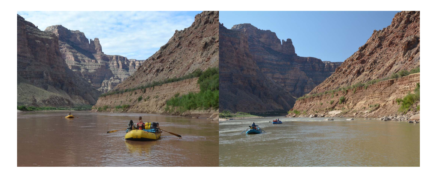
Two photos taken just above the same riffle from the photos in the previous page. The left is from 2015 and the right is from 2019. The change is subtle, but notice the rocks sticking out of the water and along the right shore in the 2019 shot that are covered in the 2015 shot. The river is reclaiming itself.