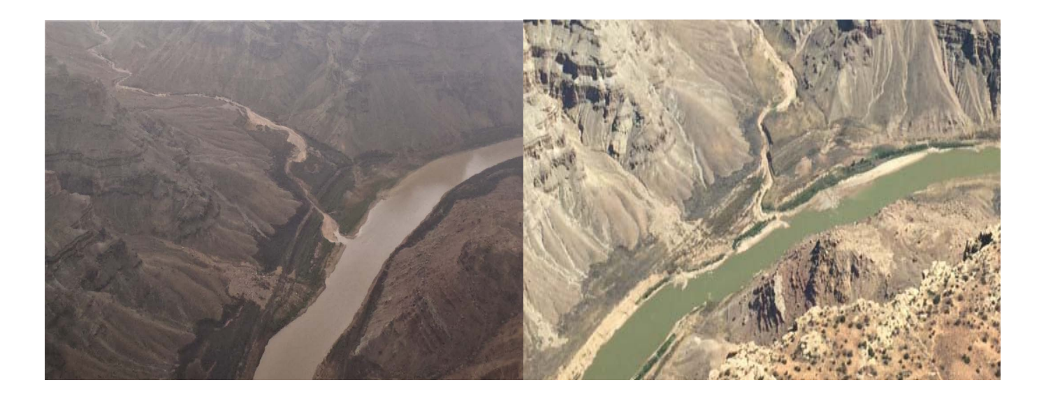
Two aerial views of Gypsum Rapid: the left from 2011, when it was submerged from a record runoff, and the right from 2019 when the reservoir was at elevation 3,620' asl. Gypsum is the lowest of the six major rapids that are beggining to emerge as Lake Powell retreats. Notice the rock outcropping on river left in the 2019 photo, and the small riffles beggining to emerge in the adjacent main channel.