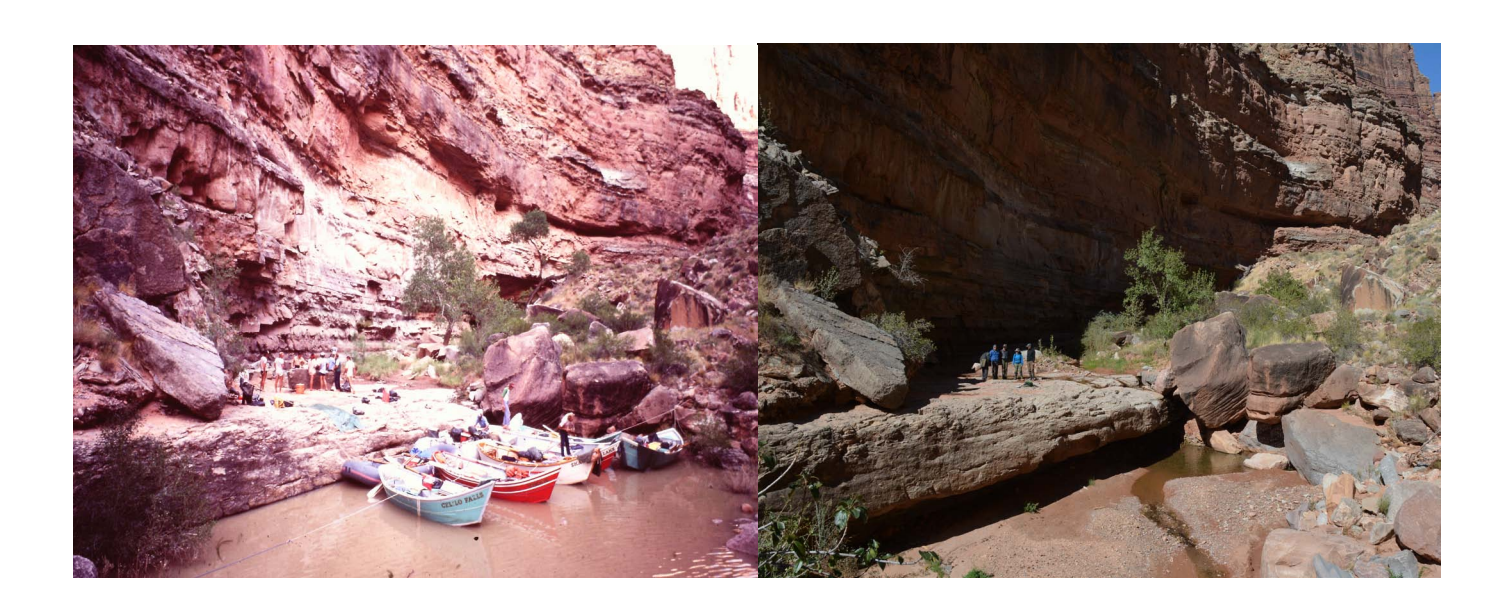
A photo match of Clearwater Canyon. On the left, a group of dories stops for lunch in 1983, when the reservoir was at its highest. On the right, the Emerging Rapids crew recreates the photo, leaving their boats at the river.